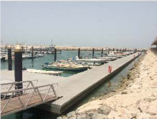
Um Sequim 1 Harbour