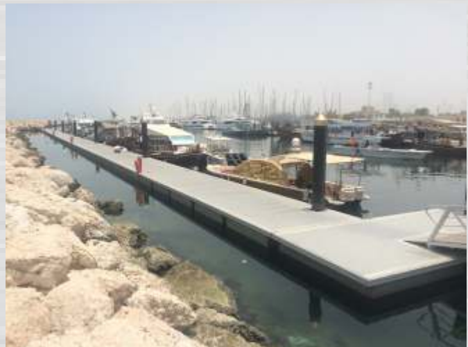
Um Sequim 1 Harbour