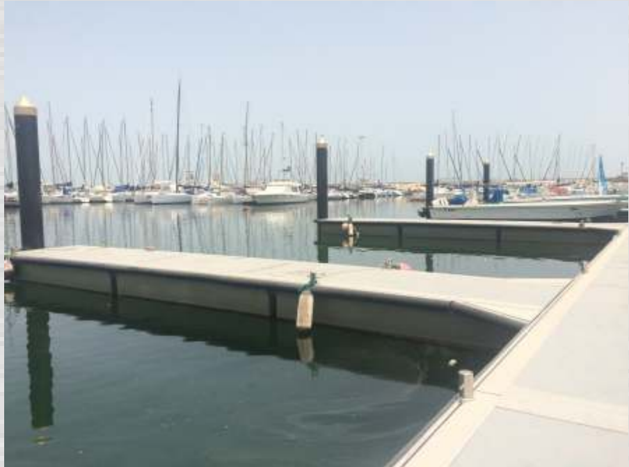
Um Sequim 2 Harbour